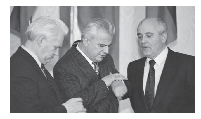
Time is up. Russian prime minister Ivan Silaev and future Ukrainian president Leonid Kravchuk check their watches as a worried Mikhail Gorbachev looks on. In the fall of 1991 Gorbachev found it increasingly difficult to deal with the two largest Soviet republics. Kremlin, Moscow, 1991.

With Russia and Ukraine against him, Gorbachev courts the Kazakh leader, Nursultan Nazarbayev. Both men wanted to preserve the Soviet Union. Here a worried Yeltsin looks on as Gorbachev talks with Nazarbayev during the signing of the economic agreement in Moscow, October 18, 1991. (Corbis)