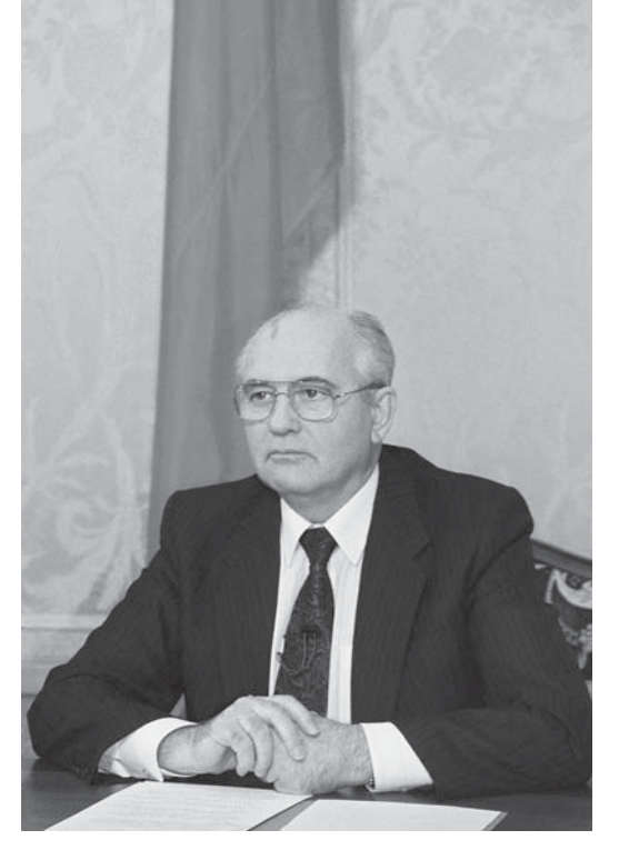
Christmas in Moscow. Gorbachev reads his resignation speech. Now it is official: the last empire has disappeared from the political map of the world. Kremlin, Moscow, December 25, 1991.