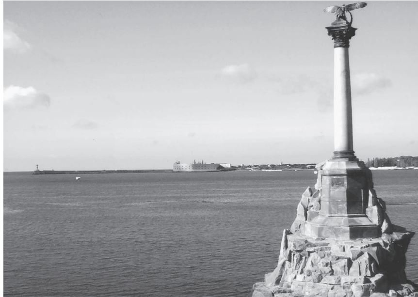
Figure 6. Scuttled Ships monument. Photograph by Karl D. Qualls, 2004.

commemorating the second defense. 18 Three days later a similar letter went out to all Crimean cities requesting a list of monuments of architecture, uses, conditions, and steps for restoration and preservation. 19 Local officials became empowered by their control of information. From this moment they not only supplied data but also began to contest and modify central plans to fit a local heritage.