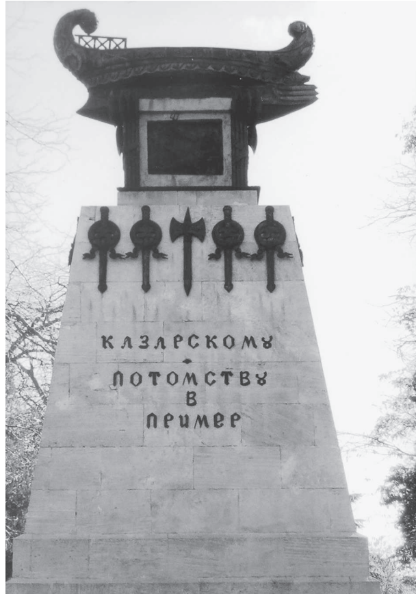
Figure 7. Kazarskii monument. Photograph by Karl D. Qualls, 2004.

After the Bolshevik Revolution in 1917, Sevastopol began to erect monuments to its revolutionary heroes, much as it had previously recognized its military heroes. From the 1905 mutinies in the tsar's navy to the Bolshevik Red Army's battle against the old guard White Army in the civil war, new revolutionary heroes joined the obligatory statue of Lenin. In 1935 a pink marble five-cornered star memorialized Lieutenant P. P. Shmidt and his comrades for leading the mutiny of 1905 and subsequently dying in front of the tsar's firing squad on 6 March 1906. Two years later sculptor M. A. Sadovskii honored the "Forty-nine Communards" who participated in the underground battle against the White Army in 1919–20. Throughout the