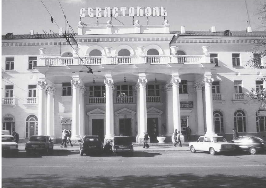
Figure 11. Hotel Sevastopol. Photograph by Karl D. Qualls, 2004.

Architects designed every element from geographic location and nomenclature to architectural style and memorials in order to give Sevastopol unique sites of identification and agitational spaces. Although many still believed in the egalitarian ideals of socialism, the social disruptions of the 1930s had perverted these beyond recognition and led to the abandonment of what many felt was the true nature of socialism. 48 The men and women who repopulated the city immediately after liberation in May 1944 set about rebuilding their homes and lives. The navy and local officials took advantage of the central officials' distractions with war and cataclysmic and widespread destruction throughout the western reaches of the USSR to articulate and make tangible their vision of Sevastopol's past, present, and future. As