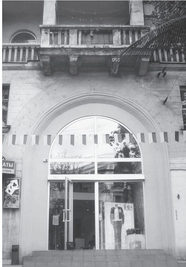
Figure 13. Fete store.

of six balusters, five were missing. The newly painted facade, much like Megasport's, set off the new commercial floor from the older, dilapidated residential floors above (figure 14). The casino, something strictly forbidden in the Soviet period, beckoned a new generation of residents with disposable income or those in desperate hope for a better future.