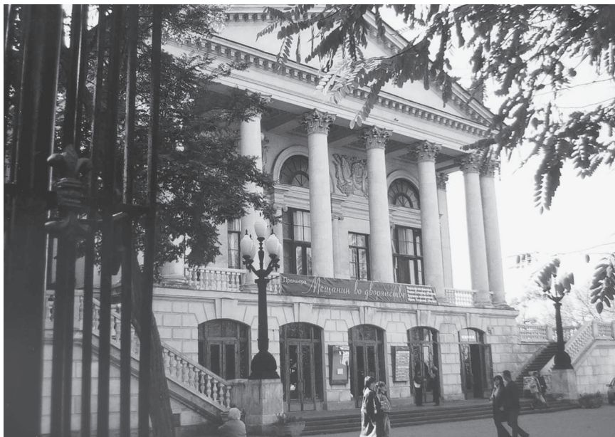
Figure 10. Lunacharskii Drama Theater. 2004.