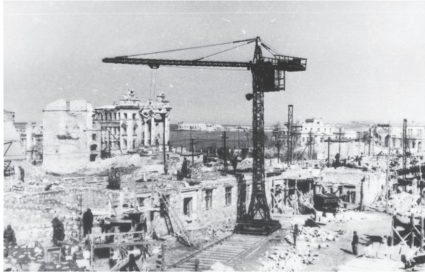
Figure 5. Reconstruction on Nakhimov Prospect. Reprinted with permission of the State Archive of the City of Sevastopol. Photograph 3258.

rebuilding housing before industry. 44 Willful rebuilding clearly disrupted planned construction elsewhere and created unintended ripple effects. Most residents outside the city center were left to build or rebuild their residences on their own. But they had little access to new brick, stone, and mortar. In the periphery, people resorted to the rubble of their homes or the ruins of ancient architectural sites to rebuild their lives. Building materials regularly disappeared from work sites and storehouses. Despite repeated attempts by local and central officials to halt the ravaging of historical treasures, like the ruins of ancient fortresses and churches, the need for building materials trumped the preservation of national landmarks. 45 The relationship between preservation and progress generated tensions as different segments of society attempted to fulfill their needs. As in much of