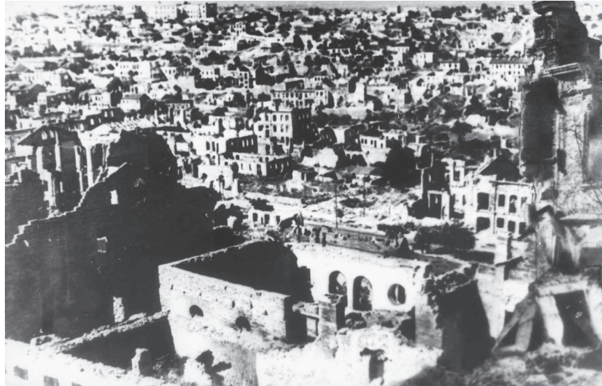
Figure 2. Destruction in the city center.

life changed immeasurably for Sevastopoltsy and other Soviet citizens. 3 Thousands of people returning to Sevastopol after the Red Army's 9 May 1944 liberation came face to face with destruction and the three thousand ragged residents who remained throughout the occupation (figure 2). The city's annihilation reinforced hatred for the enemy and strengthened the desire to rebuild the once beautiful city.