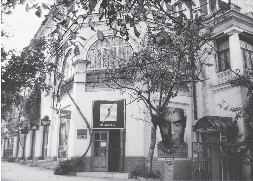
Figure 12. Megasport sporting goods store. Photograph by Karl D. Qualls, 2004.

the length of the sidewalk. Two large color posters of male athletes hung on either side of the doorway with text in Ukrainian and store hours in Russian. Thus we have a multilingual storefront promoting an all-foreign line of sporting goods. Moreover, the plaster wall facades were painted a bright white, offsetting the color of the promotional material. Juxtaposed with the bright, colorful lower floor were the essentially untouched upper two floors. The plaster walls had grayed, and the faux balustrade immediately above the store appeared particularly shabby when set off against the new white paint (figure 12).