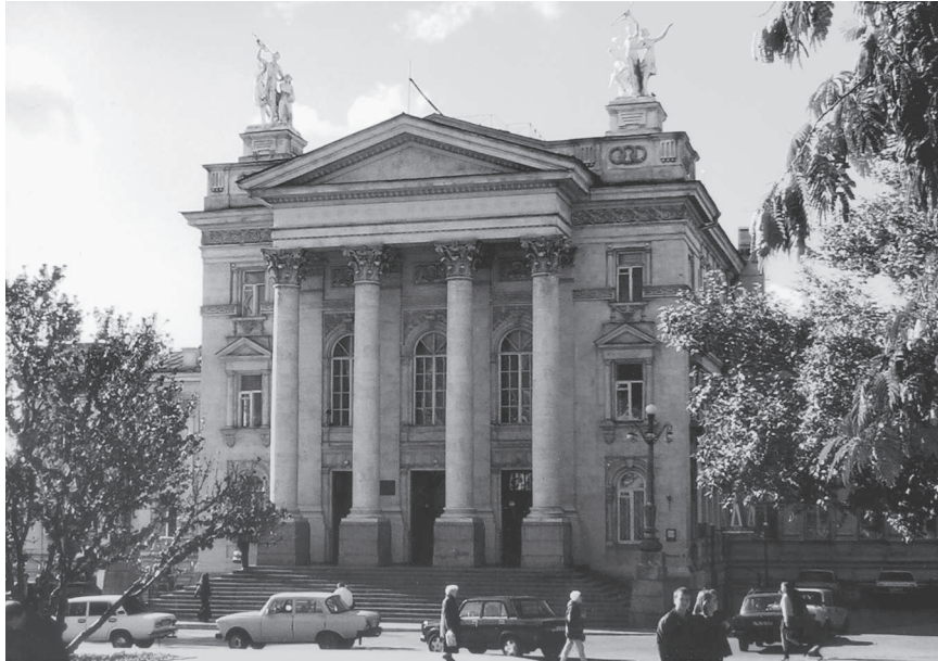
Figure 9. Former Sechenov Institute became the Palace of Pioneers. Photograph by Karl D. Qualls, 2004.