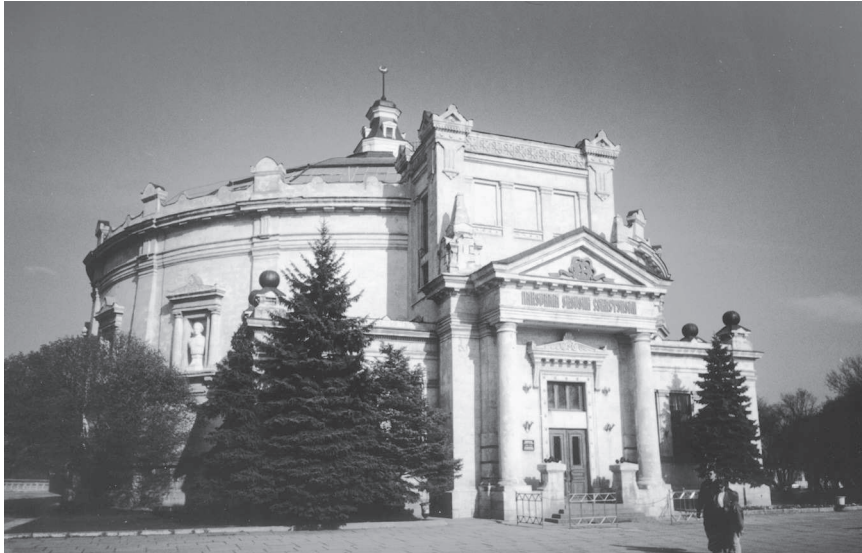
Figure 8. Crimean War Panorama on Historical Boulevard.

The narrower stance of the Ionic was based on the slender proportions of an adult woman. By contrast, the Doric column is modeled on the stouter male form. Moreover, the folds of a woman's dress inspired the vertical fluting. The classical interpretation of femininity suggested domestic and more sedentary, docile themes. Today's art museum, originally built in 1899 as a boarding house, contains many ionic elements on its eclectic facade. The Museum of the Black Sea Fleet combines the reflective images of the Ionic order with naval decoration (e.g., anchors, cannons, and flags). The principal examples of postwar Ionic construction include the award-winning housing ensemble along Bol'shaia Morskaia Street and the Sailors' Club on Ushakov Square. Ionic columns, dentils, balustrades, balconies, and loggias decorated the living space of the fashionable district and the place for entertainment and relaxation for the city's naval protectors. Although a naval museum and club could have martial tones, architects rightly distinguished them from the Doric-influenced, agitational monuments of the Panorama and Malakhov Kurgan. Museums and clubs represented relaxation and contemplation. The Panorama and Malakhov Kurgan celebrated heroic self-sacrifice in the face of the enemy with the power and authority of the Doric order.