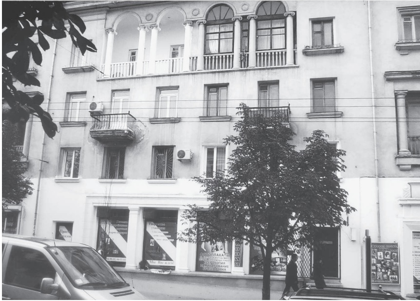
Figure 14. Store and apartments on Bol'shaia Morskaiia.

fastened to the building with cement. Directly above this dangerous balcony was a loggia with Ionic columns, also painted stark white, which contrasted starkly with the neighboring apartment's unpainted and enclosed loggia. Sevastopol's commercial and tourist development had created a wealth gap that catalyzed urban transformation and changed the original use and appearance of buildings.