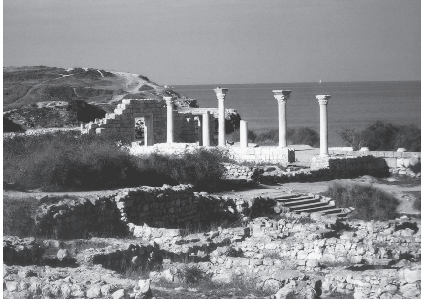
Figure 3. Ruins at Khersones Archaeological Preserve.

the city's Slavic heritage has been tied to naval warfare (figure 3). Catherine the Great seized the city from the Ottoman Turks in 1774. In 1782, after the construction of three batteries to protect the main bay, the first Russian warships dropped anchor. The following year construction began on a permanent city called Sevastopol, meaning "city of glory." In what would become a recurring problem in the city, construction proceeded slowly because of little government assistance and no comprehensive plan. War broke out again in 1787 as the Turks attempted to take back the city. The two empires forged a temporary alliance in 1798 as Napoleon began to sweep through Europe. War dominated the city's nineteenth century as the Ottoman Turks and western powers fought with Russia for dominance of the Black Sea and access to the Middle East. In both the late 1820s and 1870s, Russia clashed with the Ottoman Turks in the Black Sea and brought Sevastopol's fleet into action.