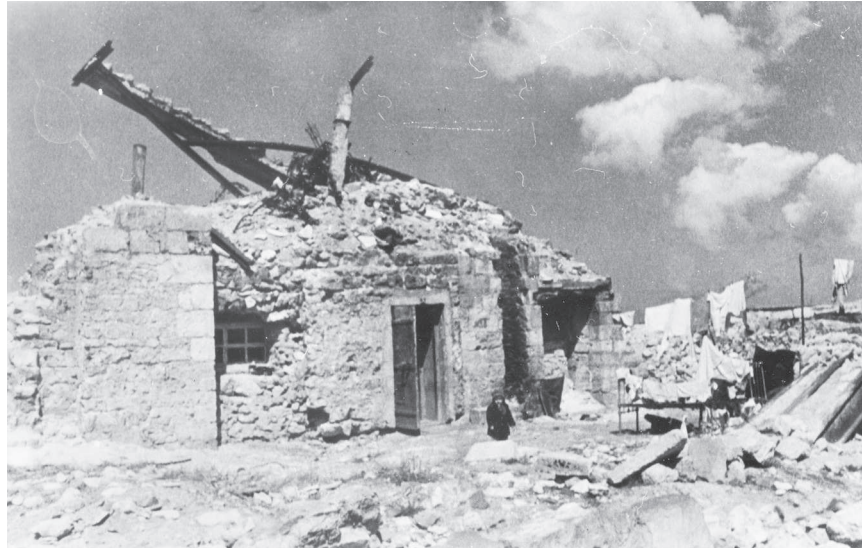
Figure 4. Girl at Gosbank vault. GARF, f. A-259, op. 7, d. 212, l. 14. Reproduced with permission of Gosudarstvennyi arkhiv Rossiiskoi Federatsii, Moscow.

in the suburbs, Zoia Il'inichna remembers most the cold winter winds that ripped through the hastily constructed wooden barracks with tar-paper windows and wide gaps between the planks. 14 Shacks began to pop up in ravines throughout the city, drawing residents closer to stagnant pools of water and the epidemics that came from them. As late as 1951, seventy-five people on Soviet Street on the main central hill crowded into 150 square meters of damp, dark, and cold staircases and bathrooms in a destroyed building with water flowing from the walls. 15 Wherever one could find an unoccupied plot and a sufficient quantity of rough building materials, houses emerged.