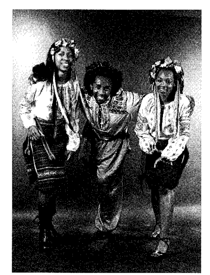
Example 1: A promotional picture for Alfa-Alfa, an Afro-Ukrainian folk fusion ensemble based in Kharkiv, Ukraine. Used with permission.

a costumed, caricatured lens through which all Others were depicted and socially categorized.